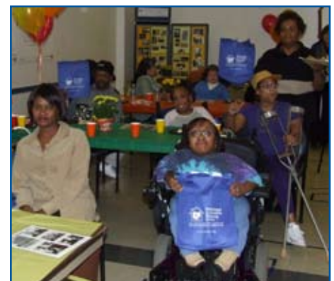
Residents of Circle Vistas show off their new MAHO reusable totes at the reception.