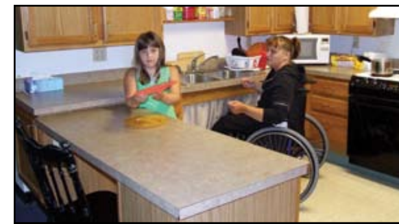
ACCESSIBLE KITCHENS FEATURE LOWER COUNTERS

The application process includes a Verification of Disability from a medical doctor, credit and criminal checks, and an in-person interview.