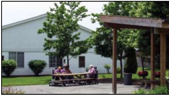
ACCESSIBLE PATIOS WITH GRILLS

“Circle Vistas is wheelchair accessible and everything is at the best level for me to use.” Circle Vistas Resident