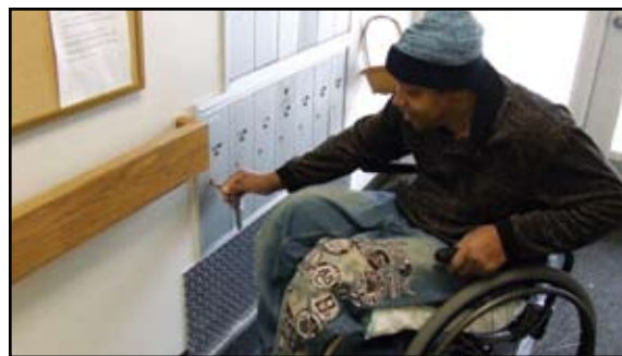
FULL ACCESSIBILITY INCLUDES EASY-TO-REACH MAILBOXES