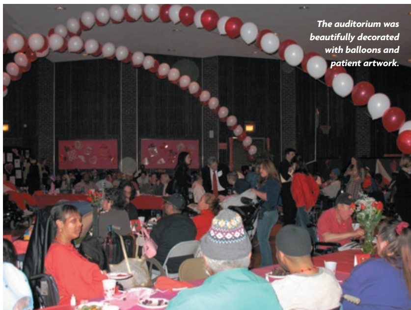
The auditorium was beautifully decorated with balloons and patient artwork.