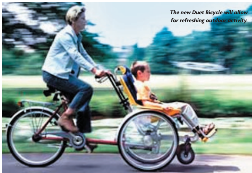
The new Duet Bicycle will allow for refreshing outdoor activity.

The cost of these two new endeavors is $10,000. We hope to expand our funding of these innovative programs and we are currently researching other programs that we hope to fund in the near future.